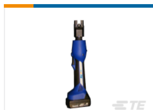
TE Part # 2217484-1 KIT, BTLI, HEAVY HEAD