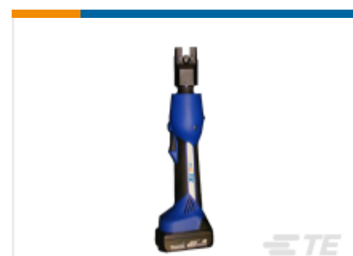
TE Part # 2217484-2 KIT, BTLI, HEAVY HEAD