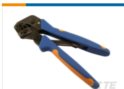
TE Part # 217212-1 PRO-CR ASSY, CES