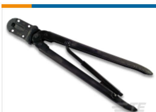
TE Part # 46866 SAHT ECECV PVF2 CLSD END SPLC 22-10 ASSY